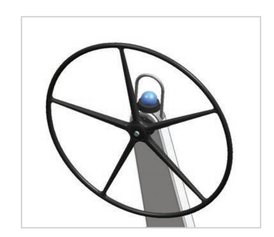
Optional compass mount with grabrail for each wheel pedestal

Integrated teak foot chocks aid helmsman position as standard.