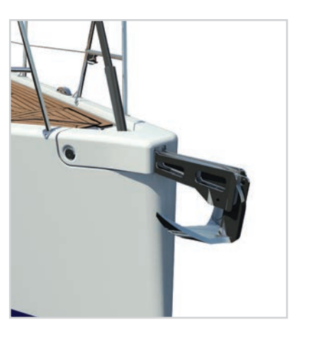
Standard GRP cowl with integrated anchor fitting