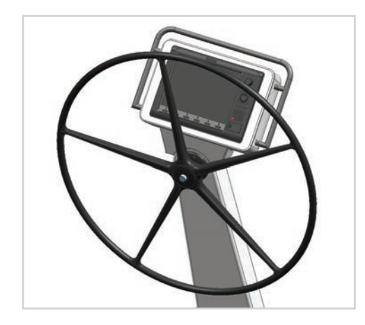
Optional large instrument mount with grab-rail