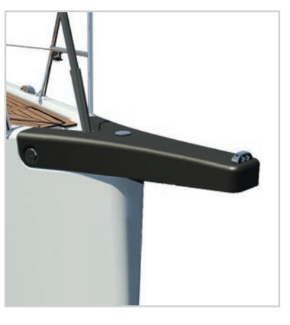
Optional carbon bowsprit without anchor