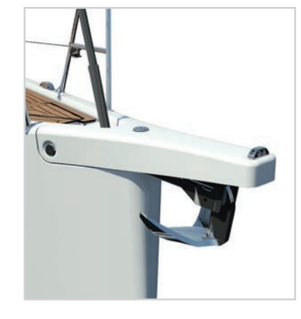
Optional carbon bowsprit with integrated anchor fitting